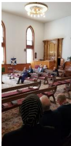
Bishopric Candidates Visit to Saint Andrew's January 18, 2019

This Tree of Life shows that members of Saint Andrews are not only interested in the religious life of the church, but also in helping with outreach and inreach.