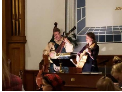
St. Andrew's Winthrop December 3, 2018 at 12:08 PM ·

As I am writing this I truly realize anew how much effort and dedication allowed us to host these events. Kudos and gratitude to all.